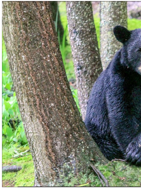
A young bear has been seen wandering around Bunker Hill, West Hill, Wapanaki, and Tucker in the past few days.