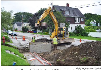
An excavator from Munson Earth Moving Corp. of Williston lowers a trench box before working on installing a new fire hydrant Friday. This was the last of the main waterline installations for Church Street, Maple Street, Slaggy Hill and Vermont Avenue. Spot paving is scheduled to begin this week.