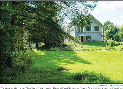
The new section of the Craftsbury Public House. The building offers leased space for a fully-equipped restaurant as well as private office spaces and an open floor space. The large beams on the trusses are reclaimed from a barn that was on the property but could not be saved.