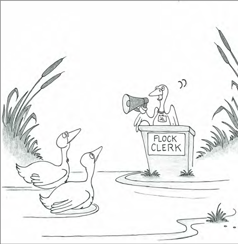
“ALL ARRIVALS MUST QUARANTINE FOR TWO WEEKS!”