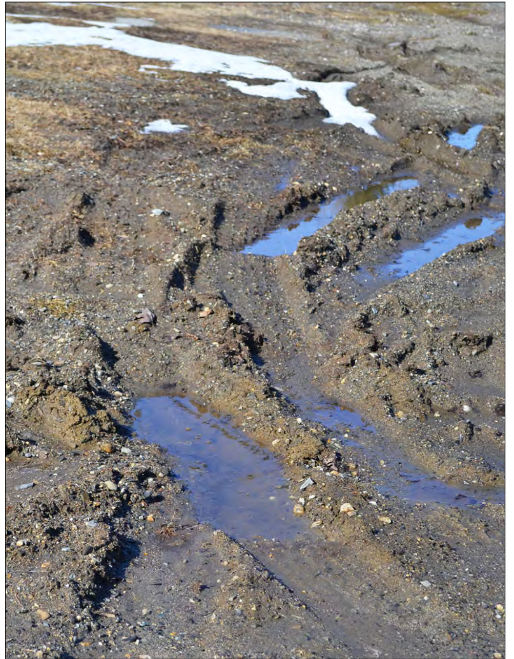
A photo taken in Greensboro April 3 pretty much sums up the spring roller coaster weather ride we have been experiencing. Snow, wind, rain, warm and cold temperatures and now muddy roads.

To register for a vaccination (once eligible), go to healthvermont.gov/myvaccine , walgreens.com/schedulevaccine , cvs.com/immunizations/covid-19-vaccine , or kinneydrugs.com/pharmacy