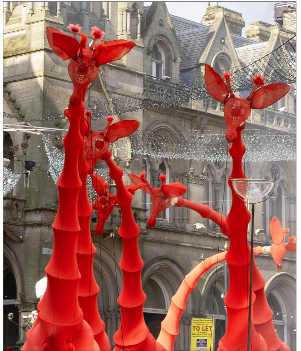
Towering red giraffes are part of the “Playing Fields” presentation by the Orleans Southeast Supervisory Union at Hazen Union School, Sept. 5.

Additional information about the event at https://bit.ly/playing-fields .