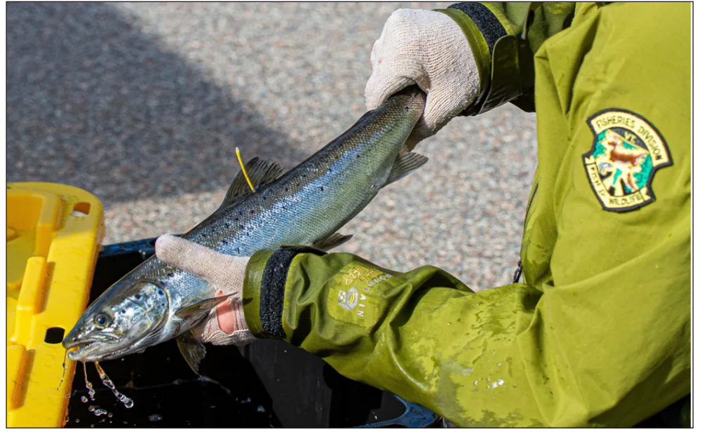
A state worker handles an Atlantic salmon.