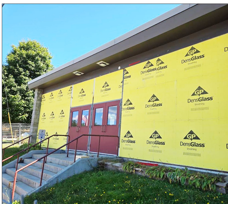
Repairs made to the sagging roof of the Hardwick Elementary School lobby last week help to get the school ready for the first day of school Monday, Aug. 25.