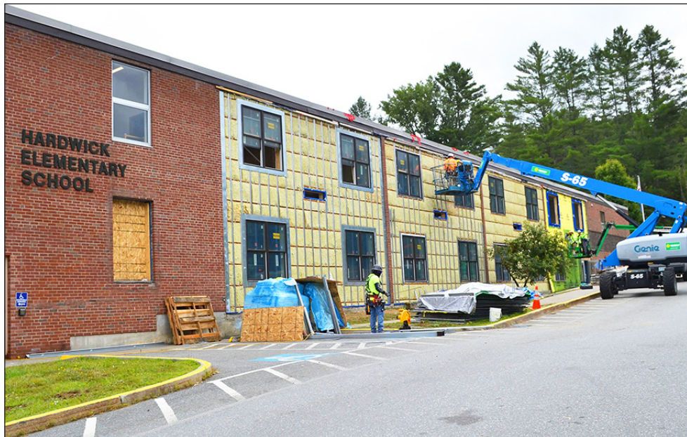
Energy Efficient Investments workers attach the metal framing Aug. 20, that will hold the new siding on the Hardwick Elementary School. Construction on the main part of the building is expected to wrap up the week of September 8.