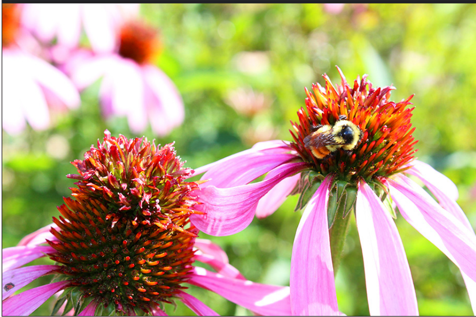
Coneflowers are adaptable to a variety of growing conditions although they prefer well-draining, loamy soil and full sun.