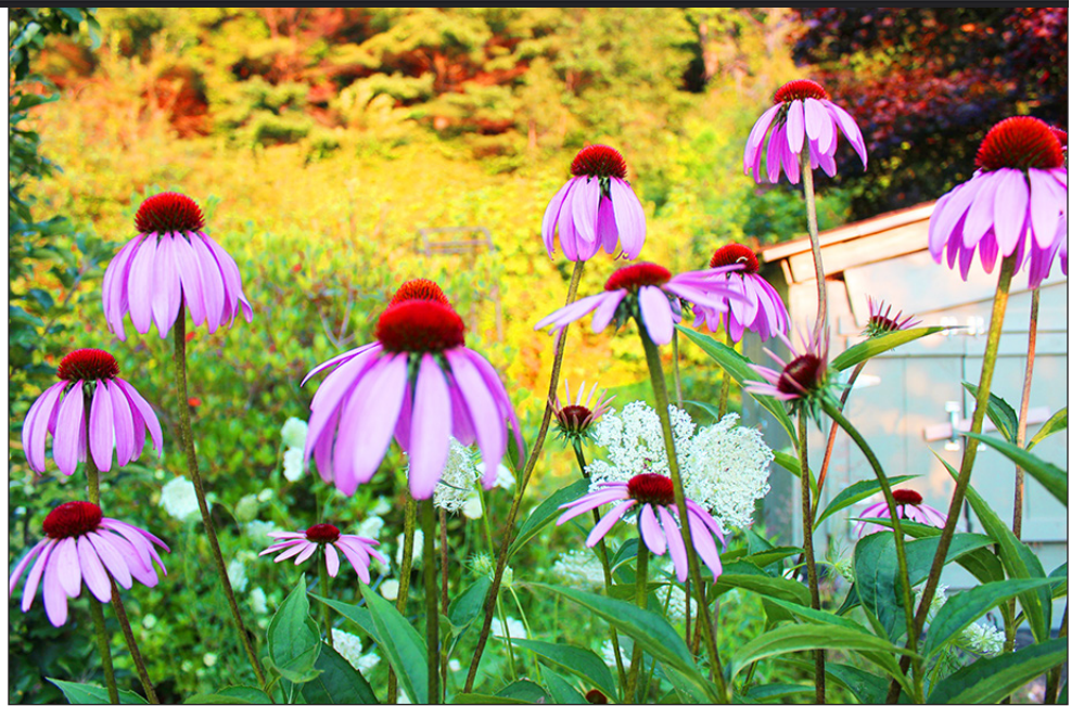
With their colorful blooms and abundant supply of nectar and pollen, coneflowers attract a wide variety of pollinators, including bees, butterflies and even hummingbirds.