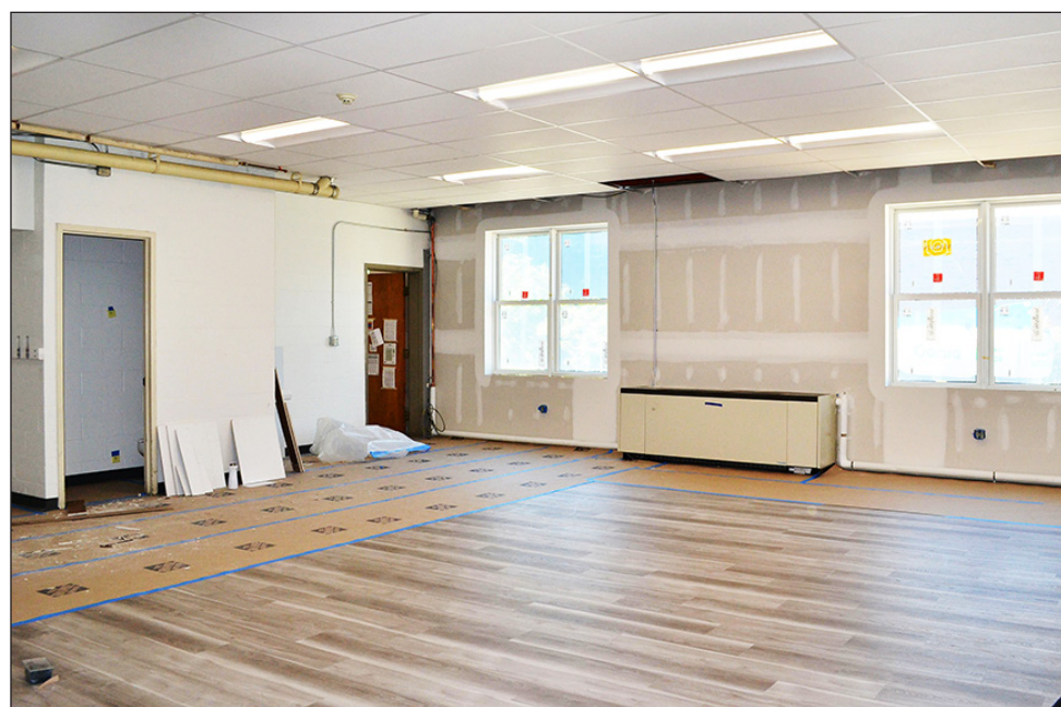
One of eight classrooms getting a complete facelift with a new thermally improved exterior wall system, new flooring and painting as part of the PCB remediation project at Hardwick Elementary School. The corner music room had similar interior work only.