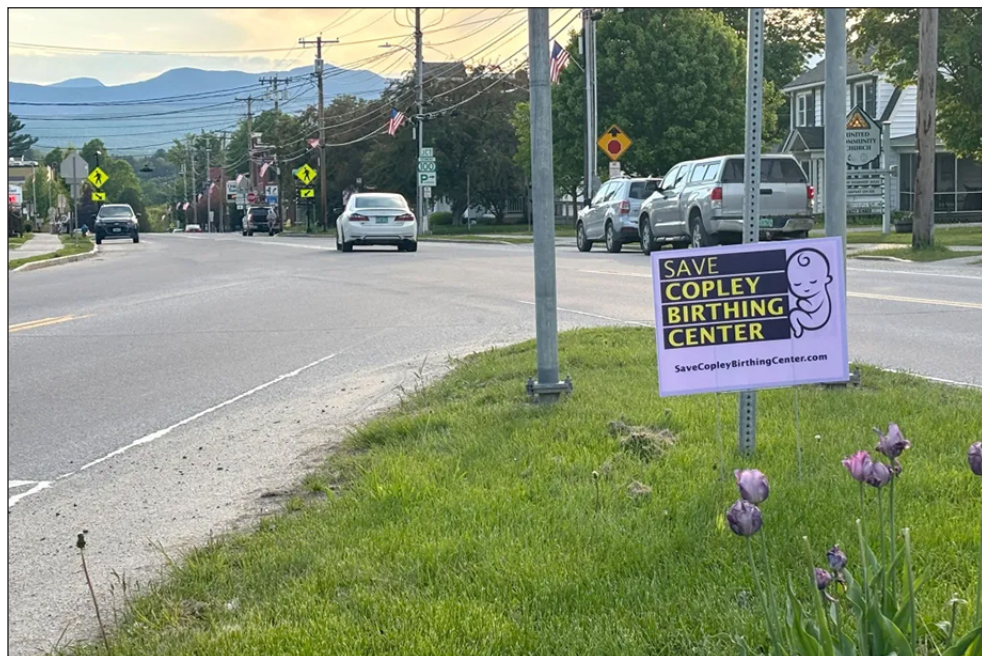
A sign in support of the Copley Birthing Center in Morrisville on Wednesday, May 28.

The hospital requested a 3.7% decrease to