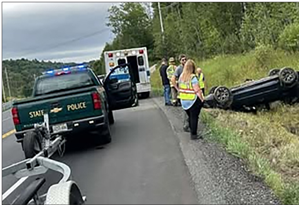
Three fire departments respond to a rollover on U.S. Route 2 in Cabot.