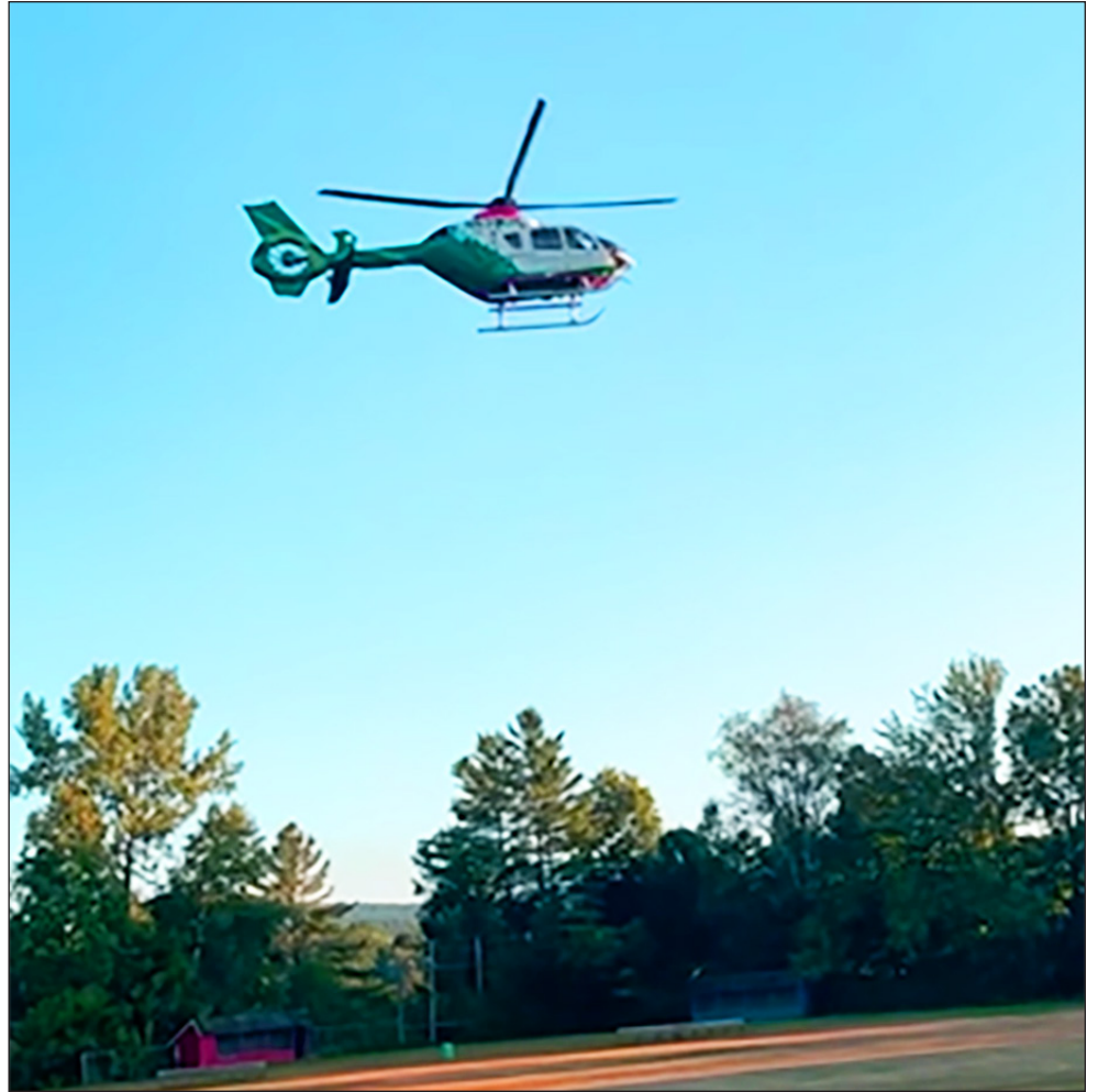
DHART hovers above the Hazen Union baseball diamond, August 22.

firefighters to assist Cabot Fire along with the Marshfield Fire Department and Cabot Ambulance. The department reminds everyone, always wear your seatbelt.